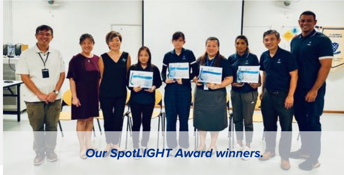
Our SpotLIGHT Award winners.