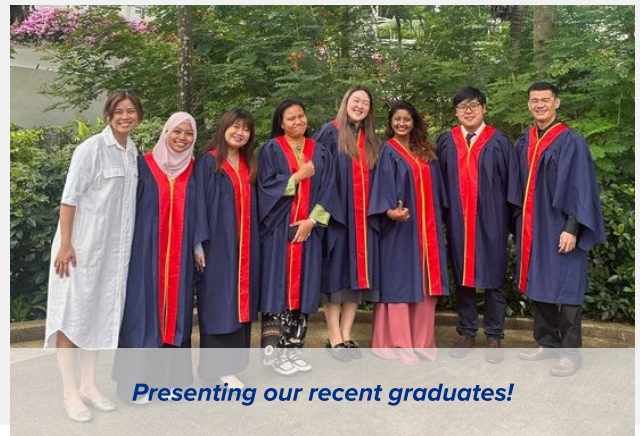
Presenting our recent graduates!

Your commitment to continuous professional growth so that you can better serve our beneficiaries sets an example for all of us at SAAC. May you continue to touch lives for many years to come!