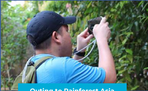
Outing to Rainforest Asia