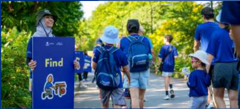
Walk of a Lifetime 2025

Working with various operators of public spaces, SAAC trained staff of various organisations and worked with them to avail opportunities for persons with autism (PWAs) to access public spaces which are usually difficult for these PWAs to access.