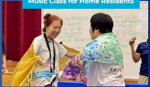
Music Class for Home Residents